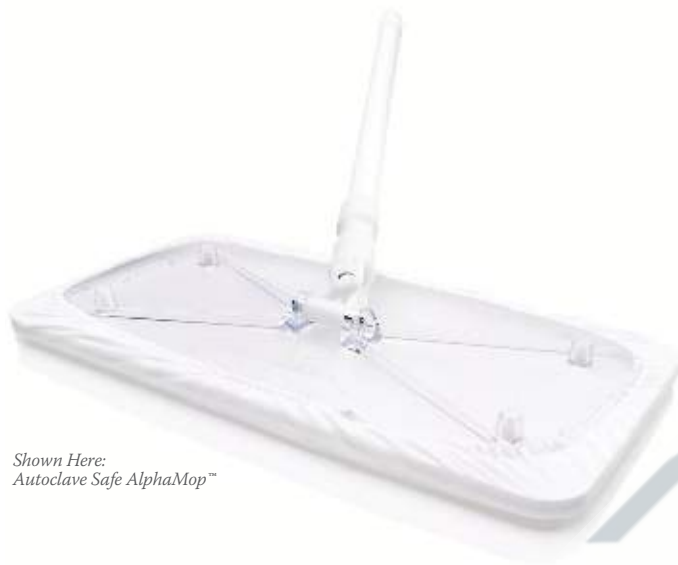
Shown Here: Autoclave Safe AlphaMop™