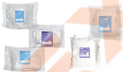
Covers & Head Refills (Non-Sterile & Sterile)