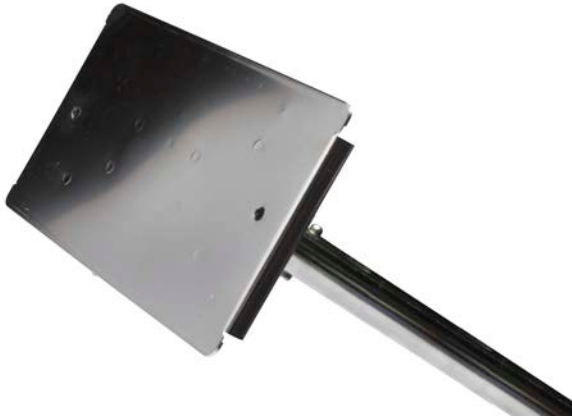
TexMop™ without Pad or Wiper attached