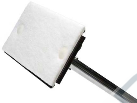
TexMop™ with Pad ONLY